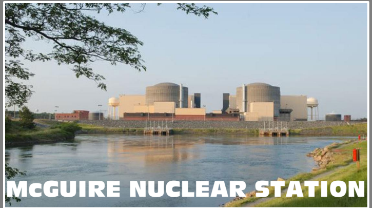
McGUIRE NUCLEAR STATION

This Fall we sent an unprecedented number of technicians to McGuire (91 total between HX and ECT). Thank you all for your hard work!!