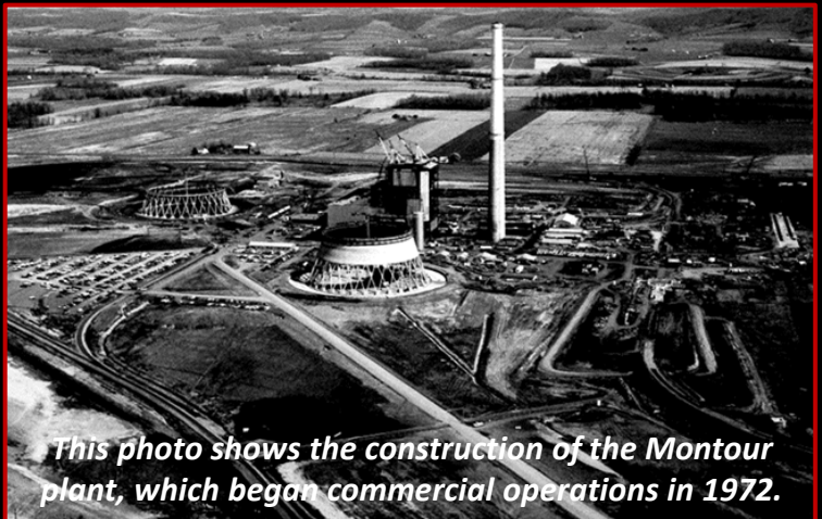
This photo shows the construction of the Montour plant, which began commercial operations in 1972.

Thank you for your sacrifice, You gave your strength, your youth, and time. You did a job not many will. You deserved our respect, and you do still. Though you didn't give your life, you were a willing soul. Only your brothers in combat, your suffering truly know.