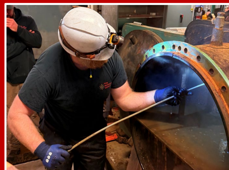
Pictured: Kettering Health tube cleaning crew