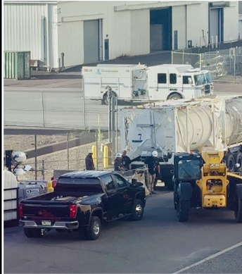
SSES Post Indicator