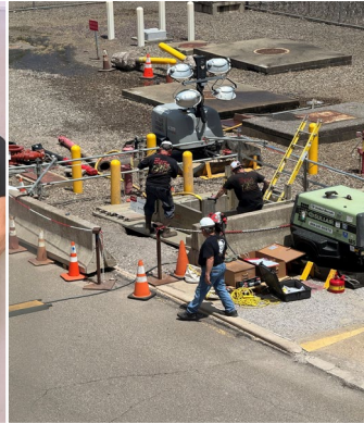
SSES Post Indicator