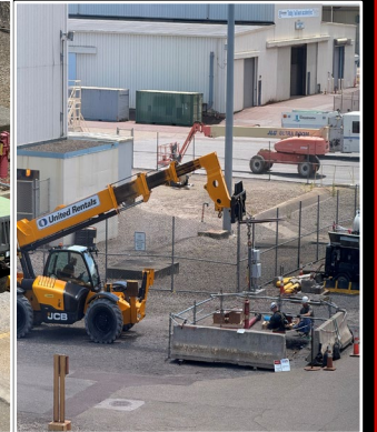
SSES Post Indicator