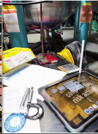
Adam Ives measuring feed water heater tubes for plugging at Oconee